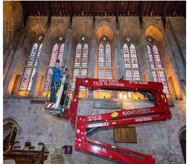
Skipton Academy Students

This ambitious project is of major significance in the life of the Priory. If possible come and see the work in progress and the splendid photographic exhibition in the Tower.