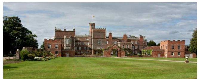
Burton Constable Hall

Whilst a small part of this large principal residence of the Constable family dates to the 12 th century, the main home now dates from the 1560's, considerably enlarged and Georgianised in the 18 th century, and filled with a vast and varied collection of furniture and paintings representing the Tudor period, Chippendale and his contemporaries and the Grand Tour.