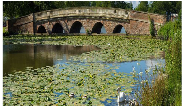
Burton Constable Hall

Hall is considered to be one of the best examples in Yorkshire of the landscape worked on by Brown. The Elizabethan mansion has over 30 rooms crammed with fine art, furniture and many surprises.